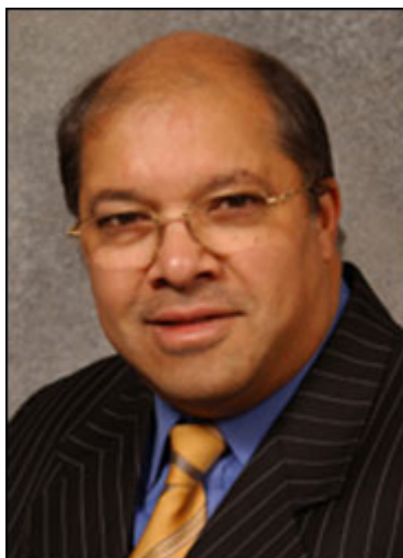
University of Colorado Denver, Department of Pediatrics