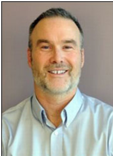
Colorado School of Public Health