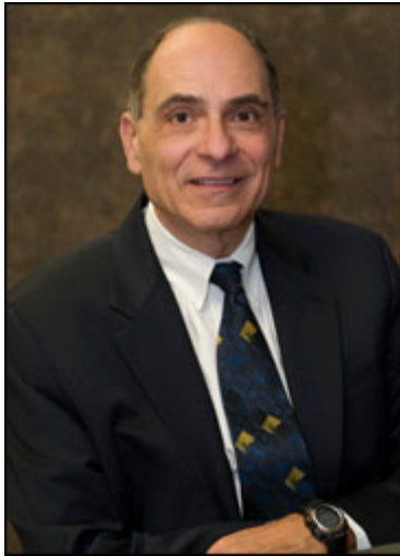
The Royal Swedish Academy of Sciences