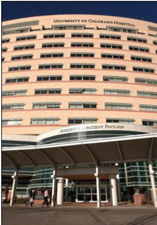
The University of Colorado Hospital Anschutz Patient Pavilion.

UCH is recognized in more categories than any other hospital in Colorado and the Rocky Mountain region. It ranked as one of the best in diabetes and endocrine disorders, gynecology, kidney disorders, respiratory disorders, rehabilitation and rheumatology.