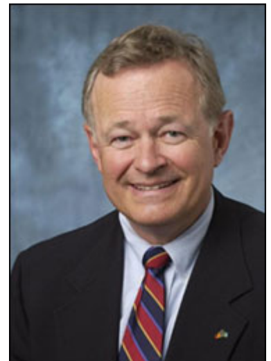
CU-Boulder Provost Stein Sture

"We will address critical issues currently related to basic and applied research for renewable and sustainable energy," Sture said. "We will also look for effective ways to convert solar, wind, ocean currents-you name it-into electricity and biofuels of some kind."