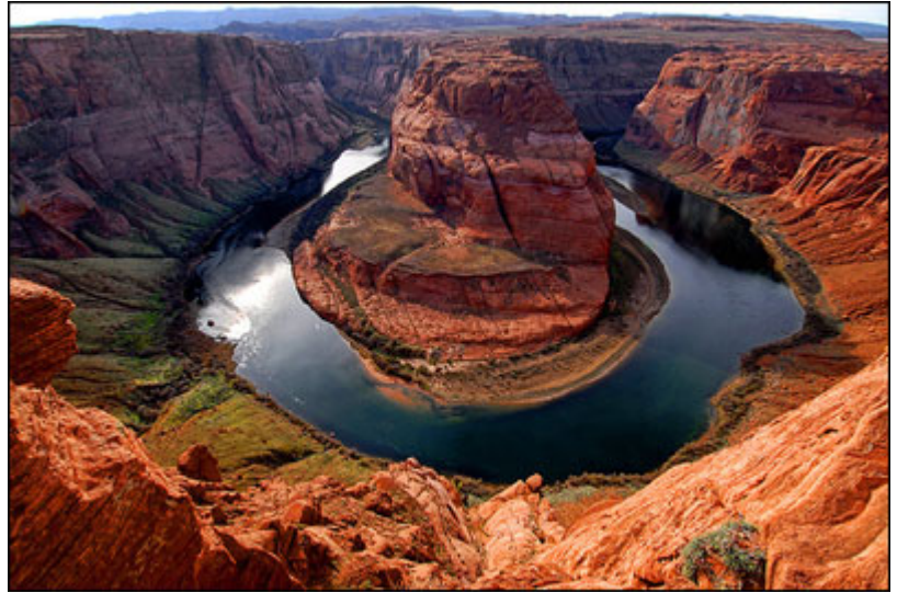
The Colorado River's famous Horseshoe Bend in Arizona.

In a new study published in the American Geophysical Union journal, CU-Boulder researchers noted that roughly 30 million people depend on the Colorado River for drinking and irrigation water.