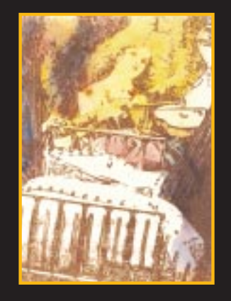
"It is a special experience to have someone show that much compassionate interest...It was helpful to see my story in a new light...You have touched me... I have changed." Nuri

"Things that never crossed my mind to tell came spilling out .. " Ariel